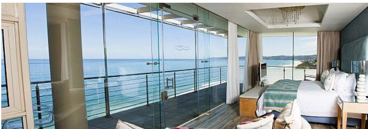
The Views Hotel, Wilderness

Both Pinnacle Point and Oubaai (see number 25 below) have accommodation on site, but we recommend the five star Views Hotel or Simbavati Fynbos on Sea. They are further away but closer to the rest of the Garden Route and its real claim to fame are the magnificent views over Wilderness Beach right below the hotel – glorious for evening strolls at sunset after an enjoyable day of golf.