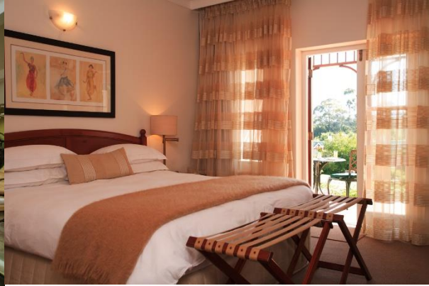
One Bedroom Suite at Fancourt