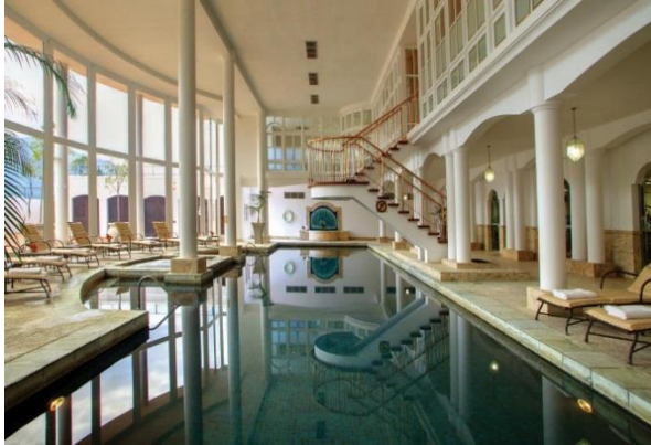
Spa at Fancourt Country Club

There's only one option on offer . (You cannot play at Fancourt Links unless you stay at Fancourt). However here at least you have the choice between the larger golf-orientated Fancourt Country Estate Hotel or the more exclusive boutique Fancourt Manor House , This is a sort of hotel within a hotel, which has access to all the facilities of the larger hotel including its glorious Spa and the three golf courses, the Links, the Outeniqua and the Montagu.