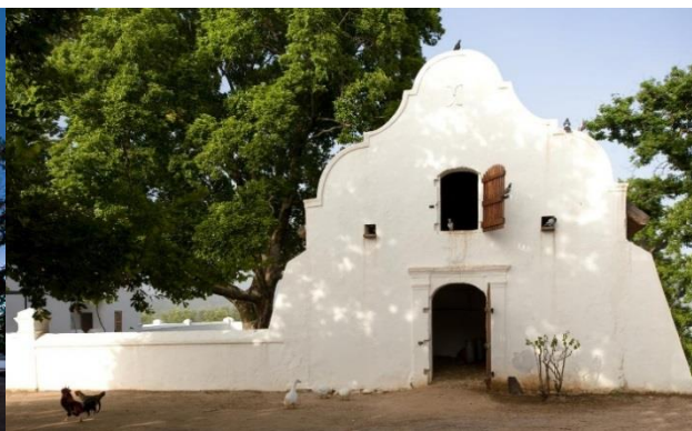
Babylonstoren, part of old Homestead