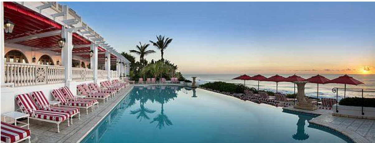
The Oyster Box Hotel

There are some lovely boutique hotels in Durban, but we prefer Umhlanga Rocks just 20 minutes' drive north of Durban with its golden sandy beaches and ocean views. The Oyster Box is one of South Africa's most famous old hotels, which has had a multi-million rand makeover, making it one of the loveliest options to stay in KwaZulu Natal.