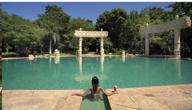
'Roman Baths', Palace at the Lost City