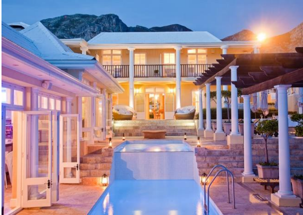
Arabella Hotel, Bedroom

Given its location approx. 15km from Hermanus, it is best to stay at the Arabella Hotel & Spa with its beautiful views over the Bot lagoon. However, if you want to combine golf with a spot of whale-watching in Walker Bay, we also recommend either Birkenhead House or Mosselberg on Grotto .