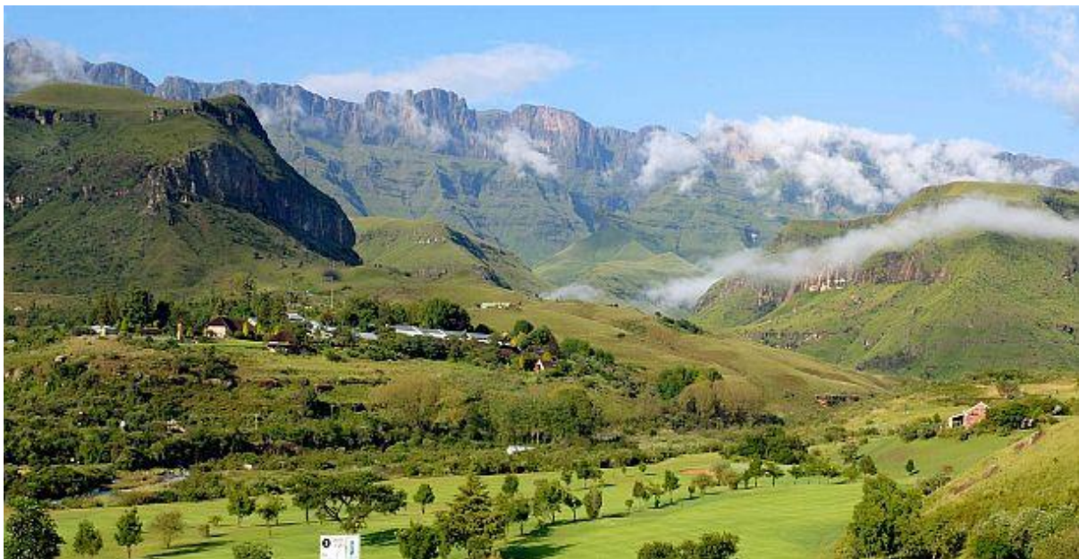
Cathedral Peak Hotel setting and golf course

(The other option in the Drakensberg is the 9-hole course at Cathedral Peak Hotel)