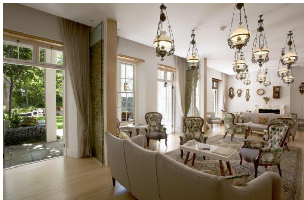
Oude Werf Hotel

Although not on the estate, we recommend staying at either Oude Werf or Majeka House in Stellenbosch. The beautifully contemporary and luxurious Oude Werf is in Stellenbosch and only a few minutes away from De Zalze. Majeka House is in a graceful garden setting on the outskirts of Stellenbosch in the heart of the Cape Winelands.