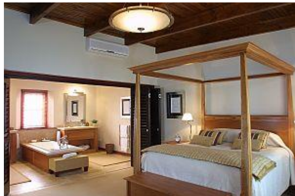
Steenberg Hotel bedroom