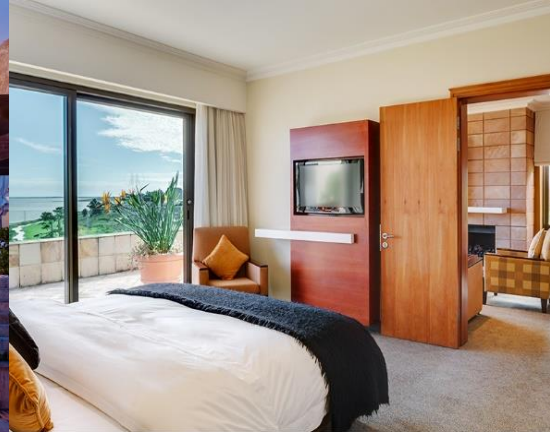
Birkenhead House, Hermanus