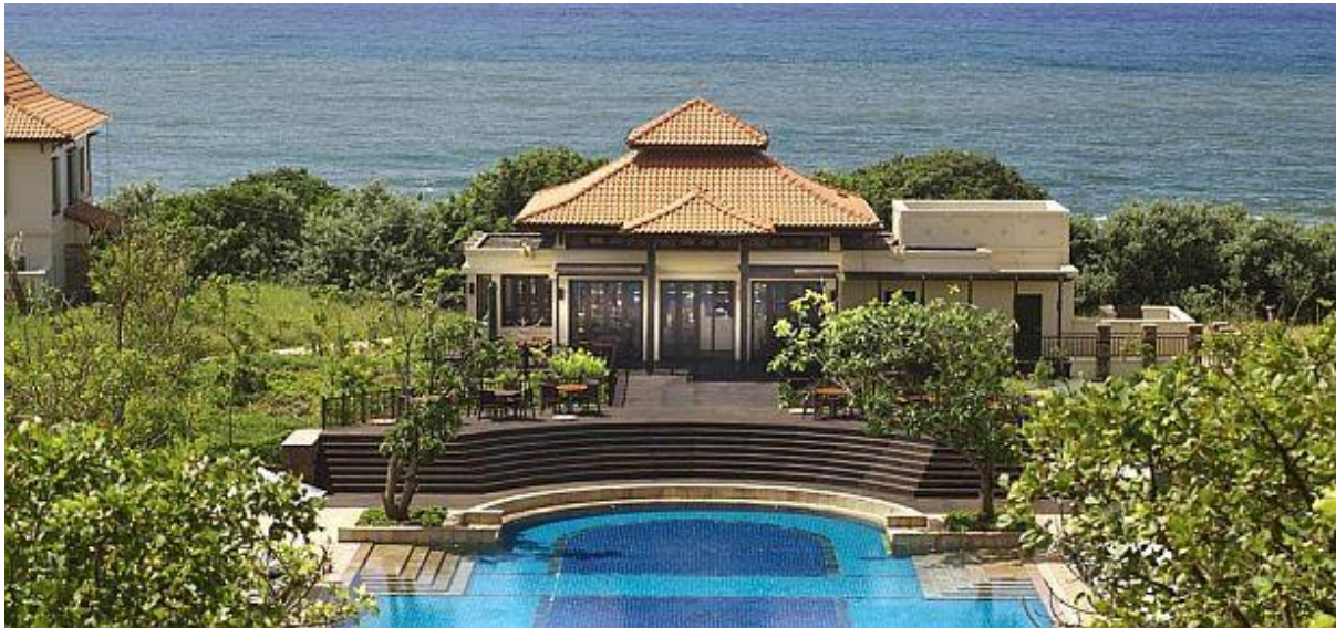
Zimbali Resort pool

The Zimbali Golf Estate offers a choice of two hotels on site: the smaller more intimate Zimbali Lodge which is set back from the ocean, and the Zimbali Resort which is larger, hosts most of the facilities and has its own beach club.