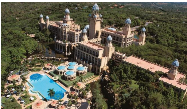
Aerial View of The Palace at the Lost City

The best option is the Palace at the Lost City , the 5 star flagship hotel within the Sun City resort. However if you are looking for something a little more low-key, then the elegant four star Cascades Hotel could also fit the bill nicely. We offer 3 and 5 night golfing packages.